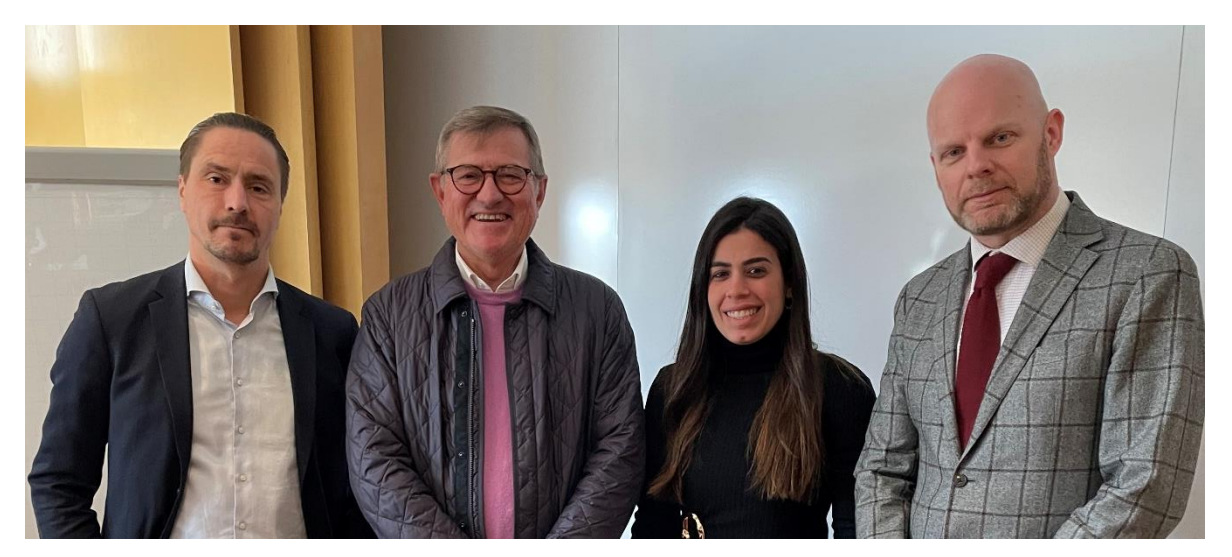
Tundra visiting GB Auto in March 2022

After the sale, GB Auto would own 49.5% of MNT-Halan which is valued at at least USD 800m in the latest transaction. GB Auto's remaining shares in MNT-Halan can thus potentially be worth significantly more than GB Auto's current market capitalization.